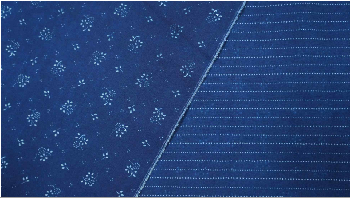
블라우드루크 원단(블라우드루크 장인 코(Koó) 제작)