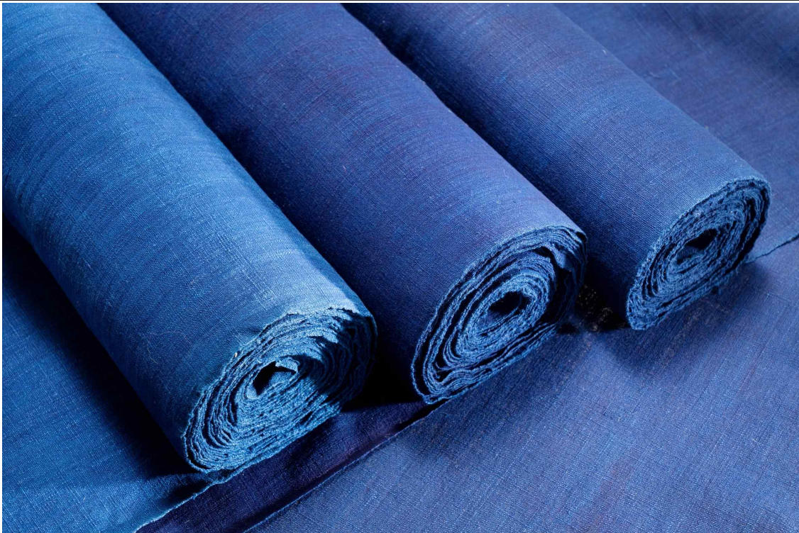
쪽염색 무명 원단(염색장 보유자 정관채 제작)