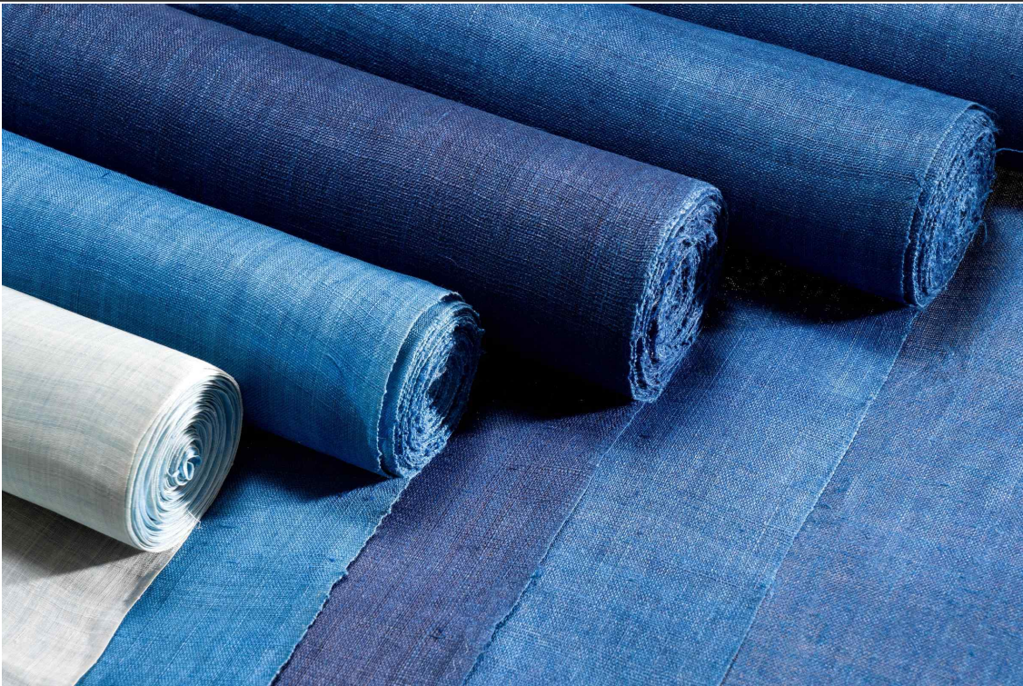
쪽염색 삼베 원단(염색장 보유자 정관채 제작)